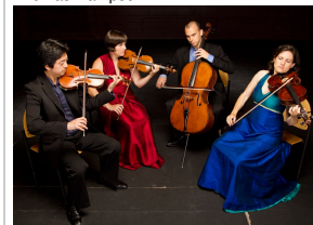
Jupiter String Quartet